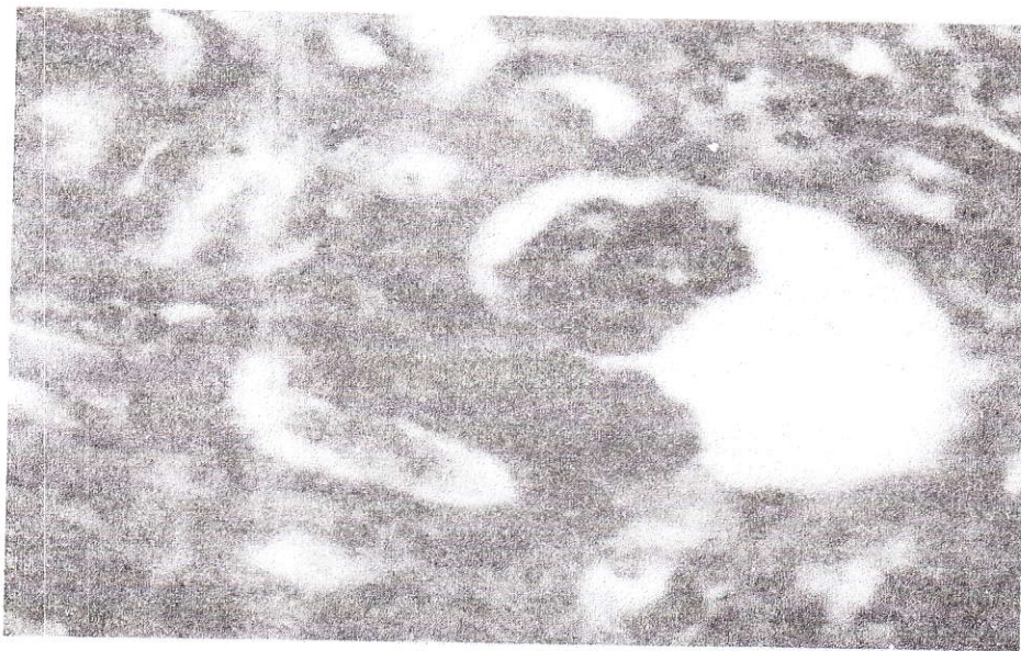
Figure (1): Shrinkage of glomerulus in glibenclamide group after treatment. H&E.40X.

Significant compared with diabetic group